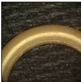
Kalrez® 9100 Top Nozzle Seal