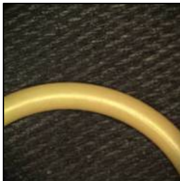
Kalrez® 9100 Poppet Seal

Figure 2. DuPont™ Kalrez® 9100 and incumbent seals after processing 5000 wafers. It was the research center's opinion that the Kalrez® 9100 seals could have continued to function beyond the scheduled PM cycle of 5,000 wafers.