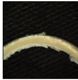
Incumbent FFKM Poppet Seal