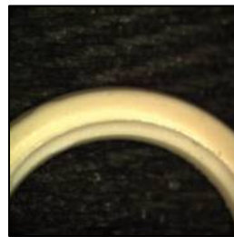
Incumbent FFKM Top Nozzle Seal